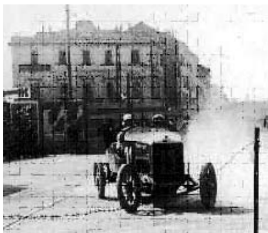
Nuvolari on a Diatto 3-litre wins in his home town of Mantova

In England in 1923 The Auto Motor Journal published a review of a Diatto 25 hp: the car received great acclaim and its performance is compared favourably to the new Bentley 3 litre. This powerful review from a patriotic English magazine benefits the Italian manufacturer. The Diatto race team continued to enjoy great success on the racetrack, winning in international competitions in England and Switzerland, beating off competition from 50 cars entered by the biggest European and American constructors. Meanwhile in the world of car design, the most famous designers in the world used Diatto bodywork: Bertone, Castagna, Garavini, Ghia, Mulliner, Schieppati, Stabilimenti Farina, Zagato.