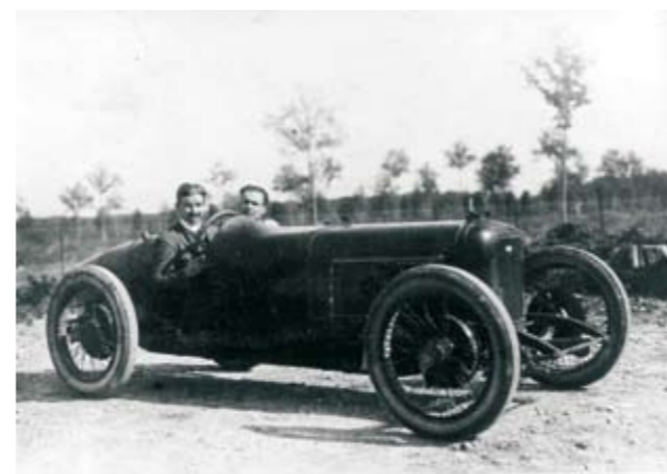
1925 - The Maserati brothers on the Diatto Grand Prix 8c compressor

In England in 1923 The Auto Motor Journal published a review of a Diatto 25 hp: the car received great acclaim and its performance is compared favourably to the new Bentley 3 litre. This powerful review from a patriotic English magazine benefits the Italian manufacturer. The Diatto race team continued to enjoy great success on the racetrack, winning in international competitions in England and Switzerland, beating off competition from 50 cars entered by the biggest European and American constructors. Meanwhile in the world of car design, the most famous designers in the world used Diatto bodywork: Bertone, Castagna, Garavini, Ghia, Mulliner, Schieppati, Stabilimenti Farina, Zagato.