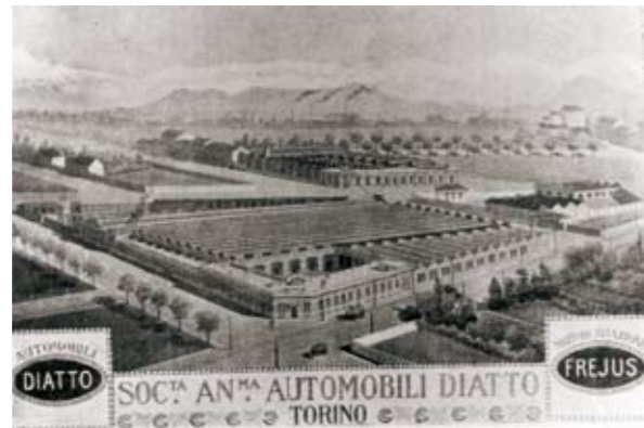
1905 - Diatto factories

Diatto produced luxury sports cars with 4,6 and 8 cylinder, supercharged engines.