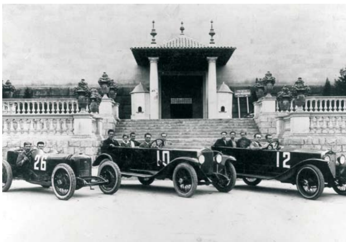
The Diatto racing Team directed by Maserati in Rebasada (Spain)