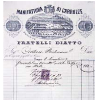
1887 - Diatto invoice for sale of carriages