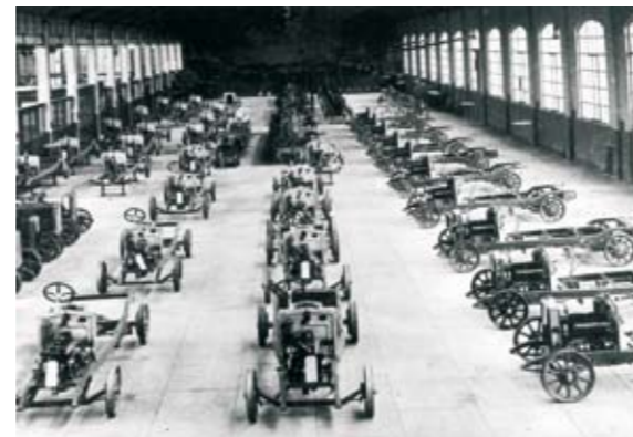
Inside the Diatto industrial plant