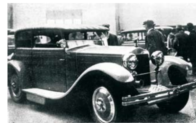
Luxurious Diatto coupé

on 14 th of June in the competitive Sport Diatto Grand Prix car (8c compressor with 160 horse-power) at the Monza Autodrome. The next year, following Diatto's official withdrawal from racing, Maserati obtained ten Diatto Tipo 30 sport chassis, equipped with 8C engines, gearboxes, suspension and many mechanical parts. With these Diatto chassis and the vast technical and sporting know-how inherited from the Diatto Racing Team, Maserati built the first sports cars with the "Trident" badge. The Diatto Gran Prix 8C compressor, which evolved into the first Maserati Tipo 26, continued to win and be competitive for many years.