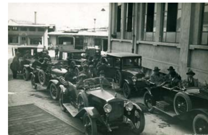
Diatto cars in the factory yard