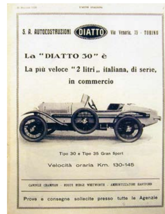
1926 - Review of "L'Auto Italiana"

In 1926 the technological supremacy gained on the race track was recognised by the international press in Diatto's road-going cars "Diatto vehicles are the fastest mass-produced two-litre Italian cars on the market" - Sourced from "L'Auto Italiana". Diatto continued racing, designing and manufacturing cars feverishly until 1932. In 1932, after approximately 8,500 cars had been produced and due to non-payment of debts accrued by the Italian government for wartime production of aeronautic engines and trucks, Diatto were forced to stop research and development. The production of spare parts finally ended in 1955.