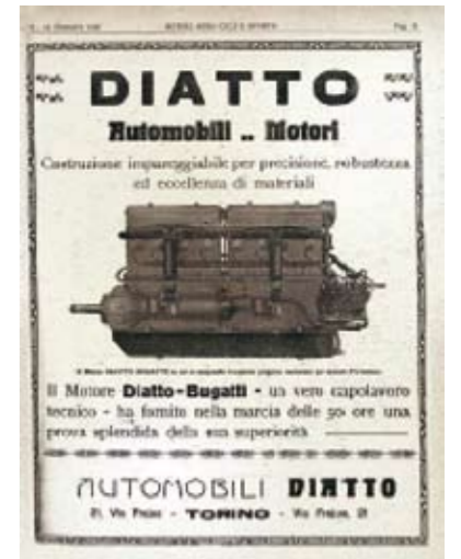
1916 - Engine advertisement for Diatto-Bugatti