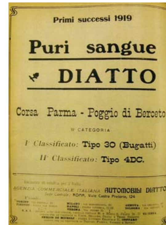
1919 - Victory Diatto-Bugatti during the Parma Poggio Berceto

Due to great worldwide demand for their product, Diatto needed to push monthly car production above 40 cars and so acquired workshops from Itala Cars, the Scacchi workshops (100 workers, 5 cars per month), the John Newton, ex Valt-Vetture Automobili Leggere Torino-, and the famous Garavini body-makers.