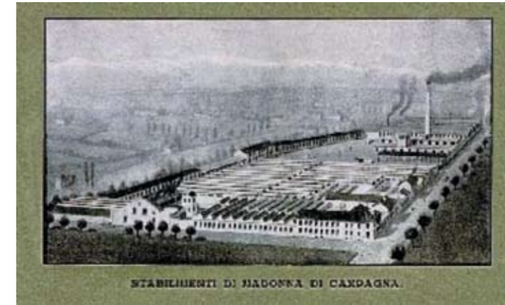
1915 - New Diatto factory

During this period of Diatto's illustrious past, Ettore Bugatti, who became a manufacturer in 1911, began a working partnership Diatto, together they developed an 8-cylinder aeronautic engine for the war effort.