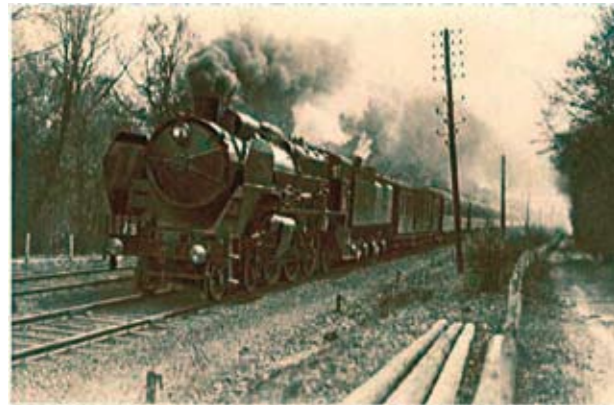
End of 18 th century Trans Europe Express