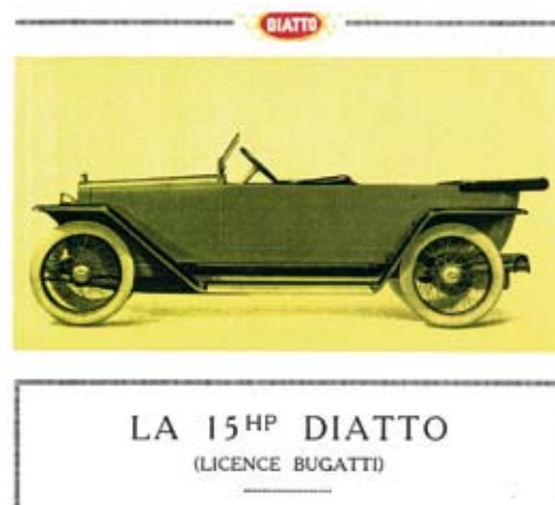
1919 - Brochure Diatto-Bugatti